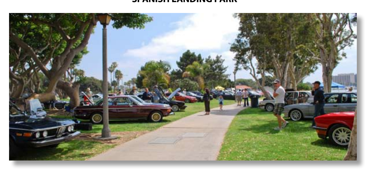
West End on the Green, at the Bay, across from the San Diego Airport

Sunday, May 17, 9:00 A.M. – 3:00 P.M. SPANISH LANDING PARK