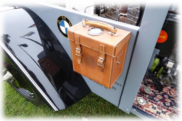
at BMW CCA Oktober Fest 2015 of the BMW F76 vintage "SUV"