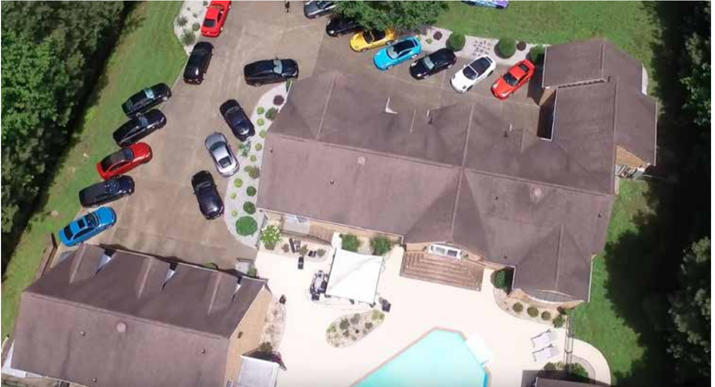
Flyover of Annual BMWCCA & PCA BBQ