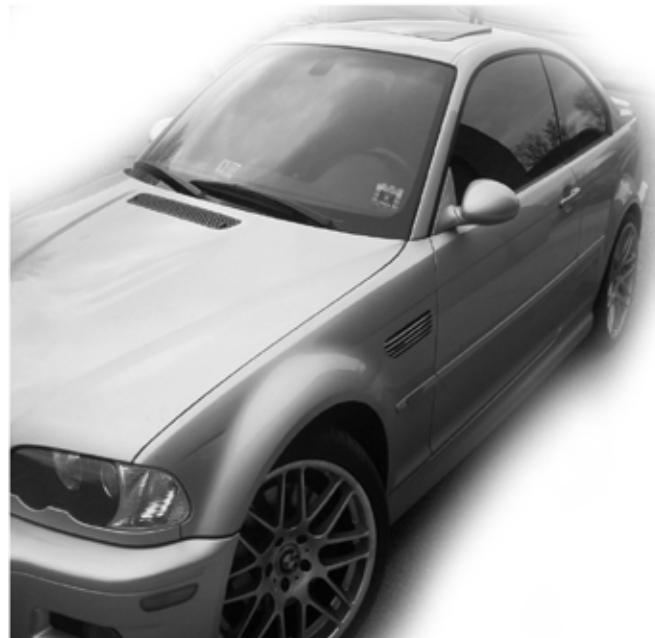
Free Tech Inspections for all BMW CCA members

or Contact us on our website autoenvybmw.com