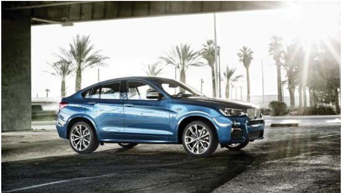
The new BMW X4 M40i

berfest or Chapter events trophies, shirts, pins, posters, wine glasses, dash plaques, grill badges, programs, or anything else. Anything from the club's past for the Archive/Museum. Do you have extra items you would consider donating? Michael: (864)250-0022; mmitchell@roundel.org. (SC)